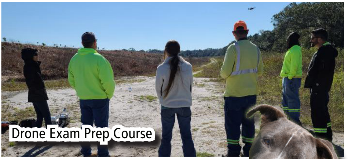
Drone Exam Prep Course

Virtual Events - Held 309 virtual events with 13,152 total attendees. Attendees spanned from all over FL, the U.S. & even Germany, Iceland & Canada Florida Friendly Fishing Guide - 68 charter fishermen & 10 non-guides earned their certification Marine Extension Programs - 1,693 volunteer hours logged Drone Exam Prep Courses - Taught 3 classes with 100% of participants passing their FAA Part 107 exam