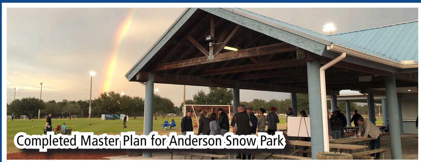
Completed Master Plan for Anderson Snow Park