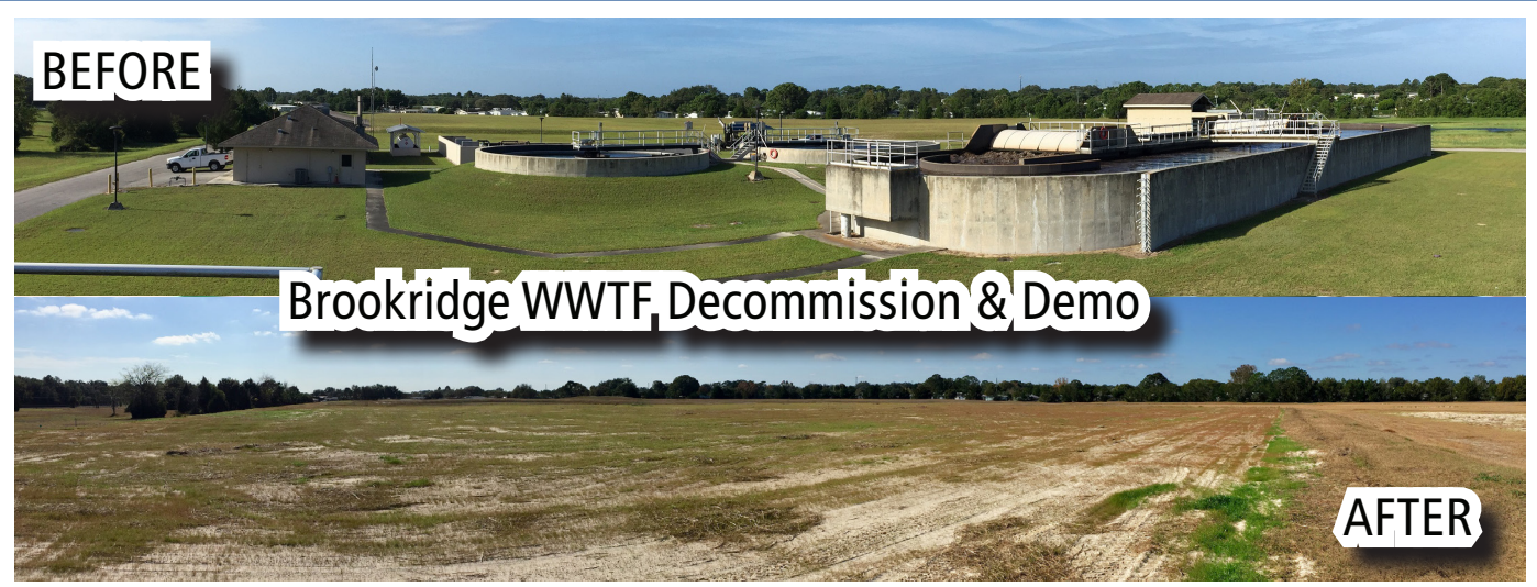
Brookridge WWTf Decommission & Demo